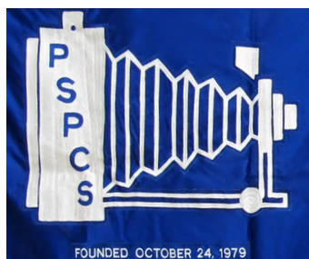
Logo from our Show Banner